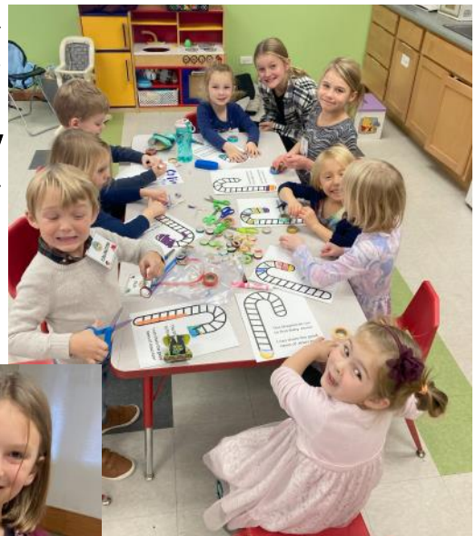
Bigs and littles working together to make shepherd staffs