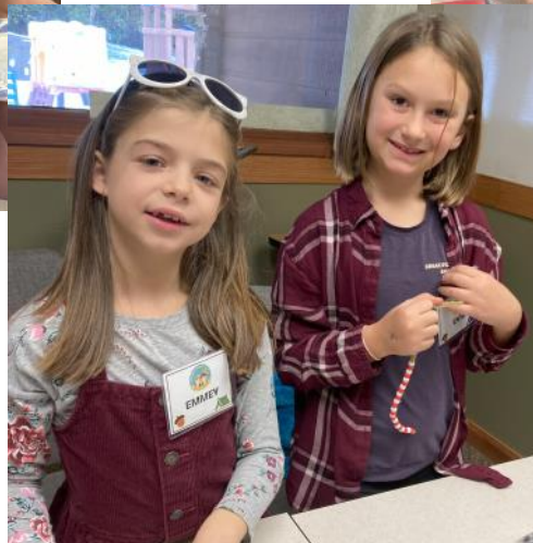
The best part of Kids Connection is being with friends