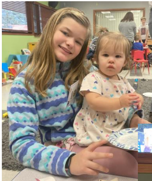
We couldn't do Kids Connection without our 5th-8th grade guides!