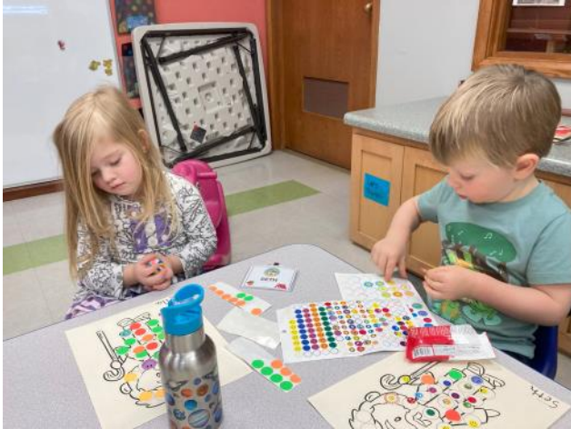
We always make sure our littlest friends have activities as well!