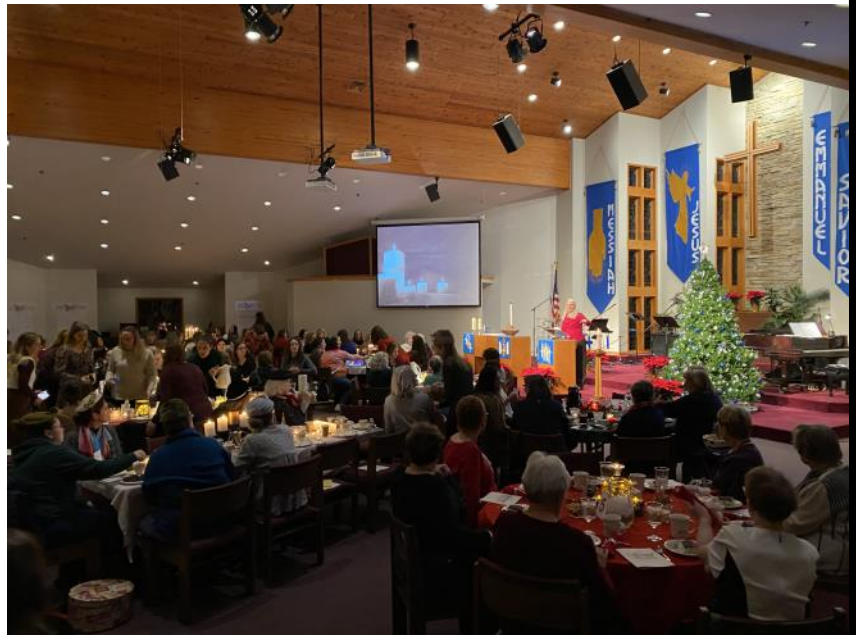
Advent By Candlelight 2023

The weary world rejoices! Many of us are weary, if you aren't you certainly know someone who is. Let us be a part of reminding one another and those we meet of the HOPE that is ours because of Jesus. What Christmas hymn has special meaning for you this year? Ponder it, and praise God for it and share what you are discovering with a friend or neighbor. Thank you again for sharing your time, talents and treasure to be a blessing to others.