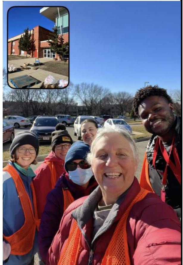
Leopold Serve Team

The body of Christ is made up of different people with different gifts and skills and what a delight it is to work together and be a part of making a difference in our community! We do all of this not for the numbers but so people will give glory to God for the love that is shared.